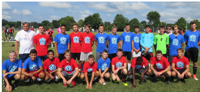
Boy's All-star participants 2018