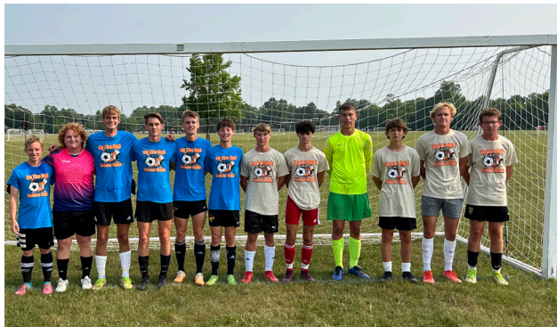
All-star participants 2023