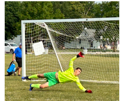
We run 2 Goalkeeper Training sessions during the weekend

1. Fill out the team application on the left. Send in the application with a $100 team deposit. This reserves your team's place in camp and is refunded at the end of camp (or can be applied to camper fees.) 2. Receive a roster sheet. Fill out, collect $50 deposits (or full fee) from players and return. 3. Balances, if any, are due at registration in July. Coaches can also register their team online.